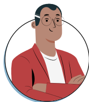
Counselors or mental health professionals