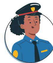
Law enforcement officers

As the team assesses a situation, it may bring in external partners, including the following, as appropriate: